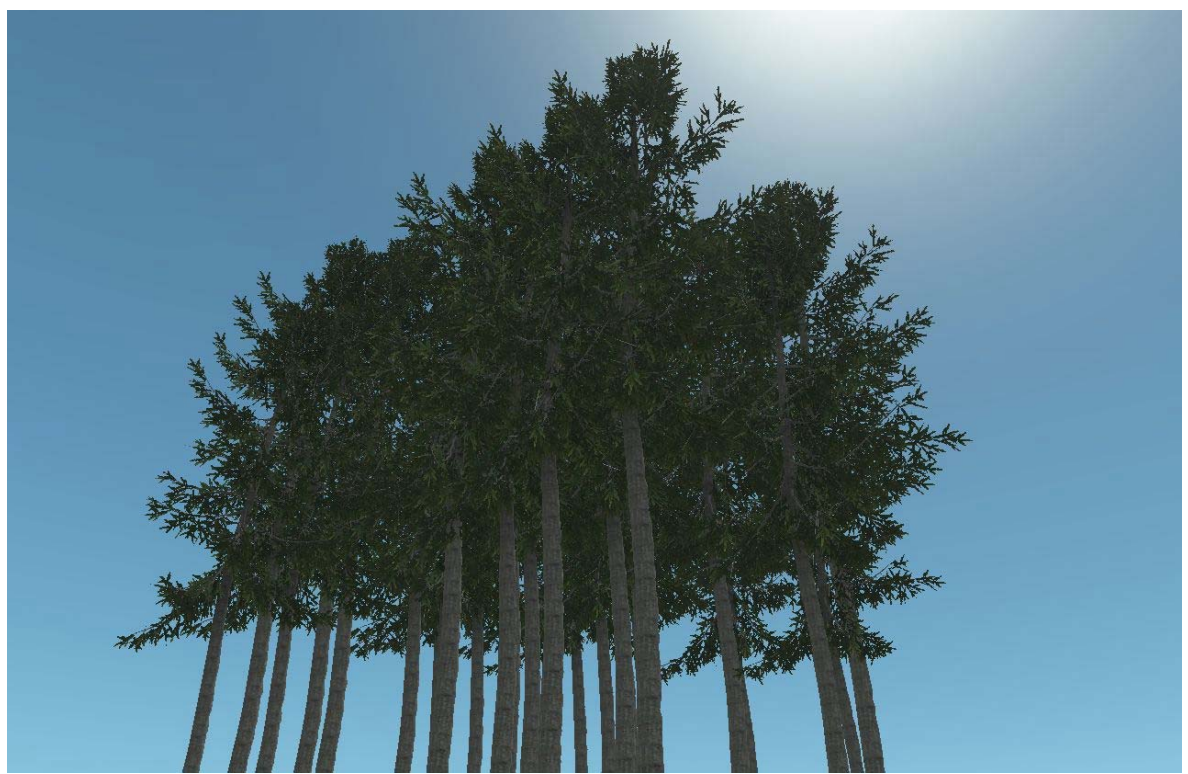
Figure 9: Forest stand visualisation calculated by the interactive thinning simulator JTragic (HAUHS et al. 2001; screenshot: Biosphere3D, Flora3D tree models, 2007)

One such application could be a forestry simulation tool where the forester can interactively decide which trees is to cut down while the forest develops over time. If Biosphere3D is used for visualisation, there are three interfaces to the application: First, the current forest has to be transferred to Biosphere3D. Second, the user should be able to select trees in the 3D view. Biosphere3D has to report which tree is visible for a given coordinate in the generated image. Third, the application should be able to modify the rendering settings of individual plants to allow highlighting of selected trees.