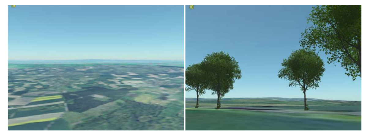
Figure 6+7: Landscape in Germany; at eye-level planting trees (screenshots: Biosphere3D, 2006; data: NASA SRTM and Blue-Marble, LGN orthophoto, Lenné3D Flora3D trees)