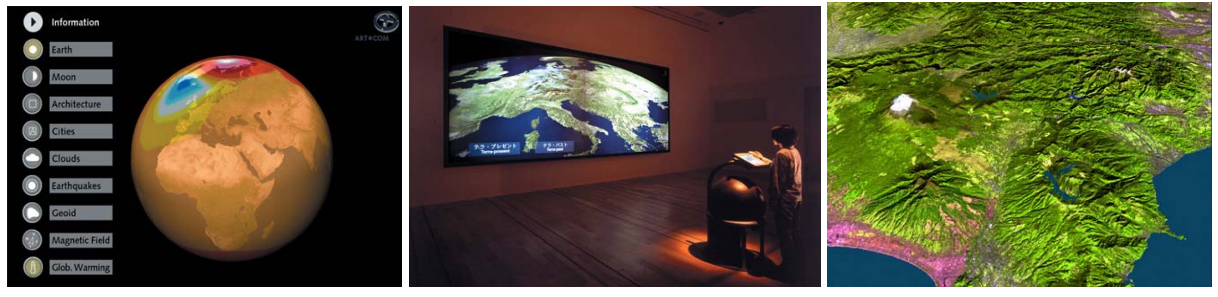
Figure 1-3: TerraVision (http://www.artcom.de)

AL GORE (1998) said in his legendary speech on 'The Digital Earth: Understanding our planet in the 21st Century': "I believe we need (...) a multi-resolution, three-dimensional representation of the planet, into which we can embed vast quantities of geo-referenced data." As early as in 1995, Art+Com anticipated somewhat of Al Gore's foresight presenting TerraVision (MAYER et al. 1995, 1996). The figures show examples of TerraVision's graphical user-interface (1), the tangible globe interface (2), and interactive terrain rendering (3). Long before of hardware-accelerated consumer graphics cards, and broadband Internet access, the world was not ready for this prototyp requiring a SGI graphics super computer. Meanwhile, the rapid development of hard- and software for interactive visualisation has been triggered by the fast growing market of computer games and paid by millions of enthusiastic computer game players.