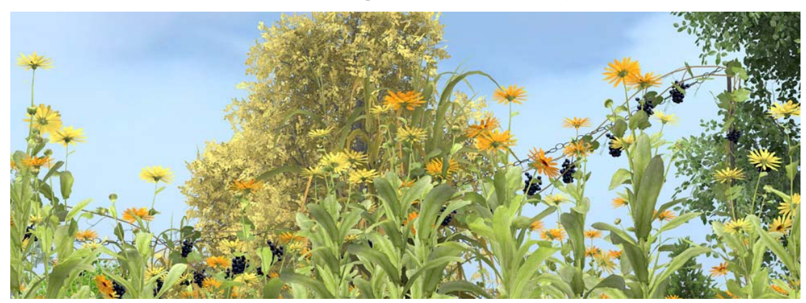
Figure 8: Pot Marigold (Calendula officinalis) in a garden (screenshot: Lenné3D-Player, Flora3D plant models, 2006)

Habitat and land-use data provide the basis for Lenne3D's vegetation modelling; the input of further geographical data allows automatic generation of plant distribution maps (RÖHRICHT 2005). Three-dimensional plant models are assigned to the distribution map and positioned on the terrain model.